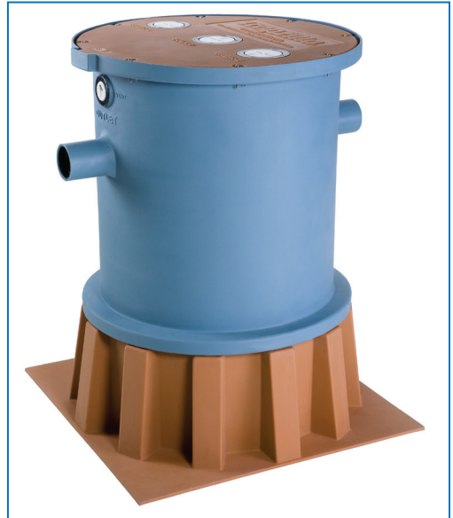
Trapzilla Model TZ-600 and Support Stand